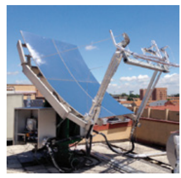
Fig.1 Asymmetrical parabolic trough