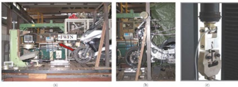
Fig.1: examples of calibration tests on scooter Yamaha TmaxS. (a) Front fork and Frame channels calibration. (b) Handlebar Horizontal calibration. (c) Rear Damper tensile calibration.

Aim of the present work was the instrumentation of a maxi scooter for the field collection of service loads acting on the scooter main components such as frame, fork, handlebar, rear frame and suspension. Service loads were collected on an instrumented Yamaha Tmax scooter equipped with 22 channels during a set of field tests that were representing a predefined road mix, covering a mileage of 270 km. Field load histories were used to develop an accelerated test procedure for the accelerated bench fatigue testing of a new model prototype whose mission was set to 50000 km. The acceleration procedure allowed a time reduction from 1600 hrs to 122 hrs bench equivalent testing. Both the benchmark scooter Tmax and a maxiscooter prototype under development underwent the bench variable amplitude fatigue testing. The results of the fatigue tests on the prototype allowed to identify some critical bolted connections and to reduce some stress concentration features causing the appearance of small cracks that were found also after during 50000 km of driving tests.